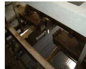
Fig 2: Top View of Gang Saw