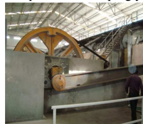
Fig 1: Gang Saw

The Granite fine is a byproduct dust produced in granite factories while cutting huge granite rocks to the desired shapes. While cutting the granite rocks using the gang saws as shown in figure-1 and figure-2, fine powder is produced which is carried along with the water and this water is stored in storage tanks. The granite fines which is carried along with the slurry is channelized to the settlement chamber. This mixture is stirred after adding chemicals for settling (Figure-3) and is then pumped to huge silos where the granite fines along with the slurry is collected. From the silo's the mixture is pumped into the slurry compacting machine (figure-4) where the excess water is removed and re circulated. The compacted slurry cakes of granite fines are made to fall in the trucks parked below from the slurry compacting machine. The trucks carry the moist granite fines and dump it in the dumping yard.