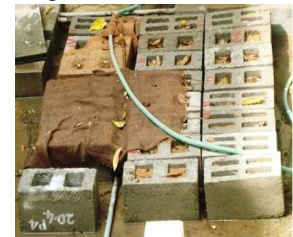
Fig-9: CURING OF BLOCKS