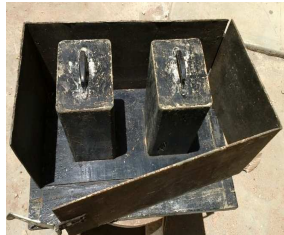
Fig-6: 2Hole Hollow Block Fabricated Mould

as shown in figure 6 and Figure 7. The size of inserts for a 2 holed block were 100mmx125mmx200mm and that of 4 holed were 145mmx45mmx200mm with both inserts uniformly tapering at the bottom by 1cm.