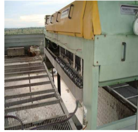
Fig 4: Slurry compacting machine

India is one of the best granite deposits in the world, having excellent varieties comprising over 200 shades. India accounts for over 20% of the world resources in granite. Granite reserves in India have now been estimated by the Indian Bureau of Mines at over 42,916 million cubic meters. In India there are 350 major granite factories are running, so the total production of granite fines waste may go up to 1 lakh m^3 which can be effectively utilized in the production of concrete and related products for sustainable development. The objective of this paper is to produce high strength hollow concrete blocks with the addition of granite fines as an additive because of the properties of granite fines it is possible to fill the pores in the hollow concrete block which otherwise is very porous. By varying the proportions of fines, the optimum proportion of fines addition can be determined. The data thus obtained can be compared with the hollow concrete blocks manufactured by conventional lean mix concrete available in the market. Different mix proportion is taken to study the strength of the hollow blocks by using granite fines.