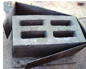
Fig-8: DEMOULDING OF BLOCKS

mixer is poured into the steel mould in three layers with constantly tamping with the rod, when mould is filled fully then it kept on the vibrating machine for further compaction then the top most layer levelled with rod. Then after 24 hours de-moulding is done and the freshly prepared block is ready for curing. Curing is the most important aspect of the production of the blocks. All efforts to produce quality blocks will be useless if curing is not done properly. Also in the study, in order to reduce the water cement ratio blocks were cast using water reducing plasticizer SP-430 at a dosage of 1.25lit/100kg of cement at a water cement ratio of 0.45 to study the effect of water reducing agent. The concrete blocks are usually cured for at least 14 days [IS 2185 – Part 1 (1979)] page no 10, either using sprinklers or pressurized/non-pressurized steam curing until they are sufficiently hardened to handle without damage.