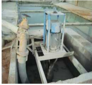
Fig 3: Settlement tank