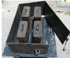
Fig-7: 4 Hole Hollow Block Fabricated mould